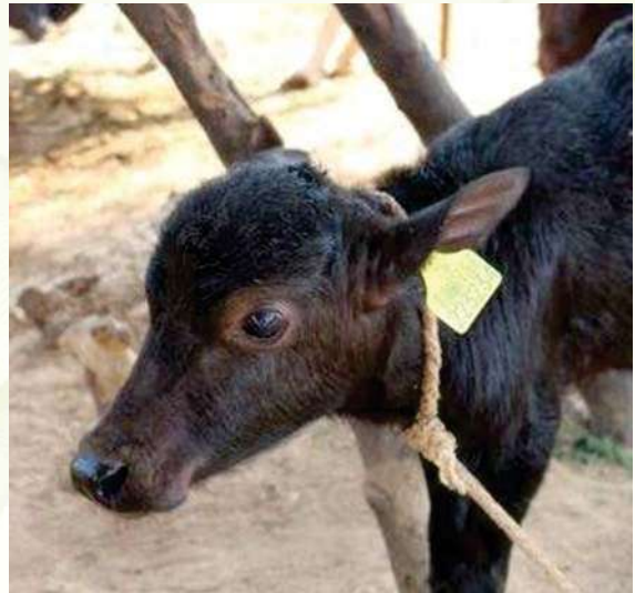
Figure A.3: Ear Tagged animal

The specifications for the ear tag shall be: The male tag as a button shall be with a minimum diameter of 27 mm with a metal point and the flag shaped female tag with a closed head shall be with a minimum size of 55 x 65 mm. 12 digits to be printed in two rows of six digits each; second/lower six digits shall be relatively much larger than first/upper six digits.