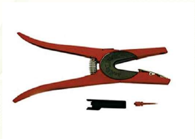
Figure A.2: Tag Applicator