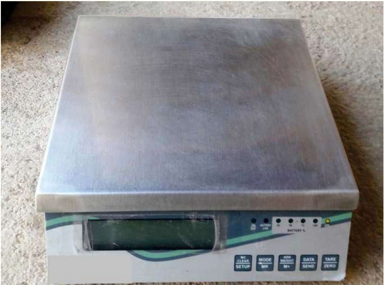
Figure A.4: Smart Weighing Scale