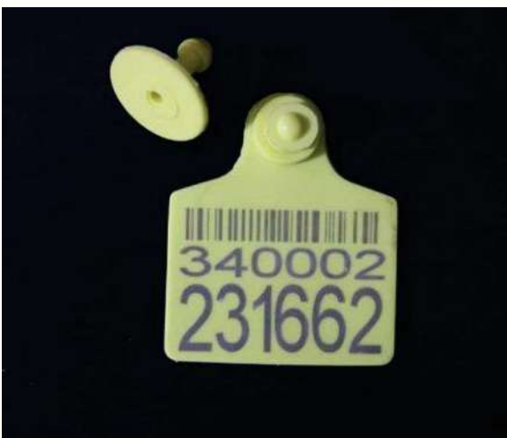
Figure A.1: Ear Tag

Only polyurethane laser printed ear tags having a 12 digit number and a bar code shall be used. The numbering system followed shall be unique with the last digit of the number being a “check digit” to ensure that no two animals are tagged with the same number. Only numbers supplied by an agency identified by DAHD shall be used for unique identification of animals.